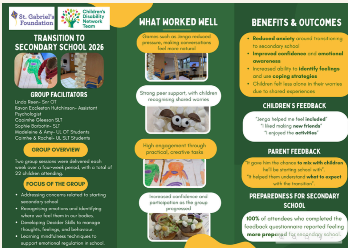
Transition to Secondary School Group