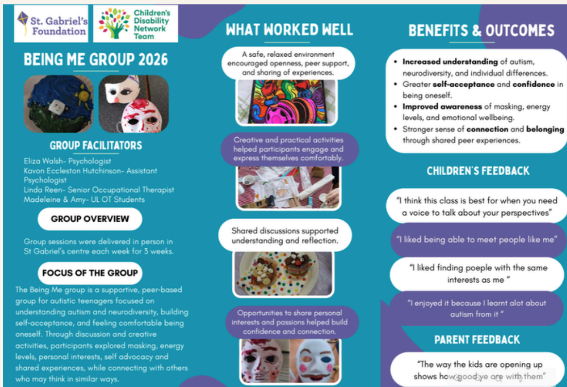
Being Me Group