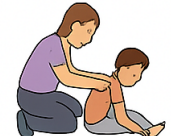
Heavy Massage (deep pressure massage)