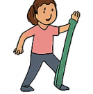
Gym Ball sitting & Bouncing