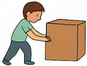
Pushing Heavy Box